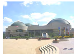
Canadian Museum of Civilization