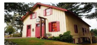
Old Hastings Mill Store Museum