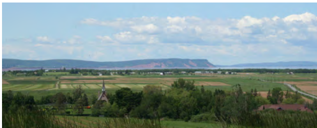
Grand-Pré National Historic Site of Canada and World Heritage Site

While I maintained an active research profile during my years with Parks Canada, producing publications and presenting papers on Canadian architecture, heritage management and World Heritage, my university research has focused on interdisciplinary studies, resulting for example in a publication on the architectural and landscape heritage of the mountainside campus of the Université de Montréal.