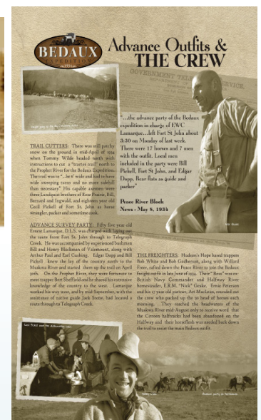
Panel from Horses, Horsepower, and Horsing Around