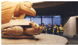
Raven and First Humans, MOA

MOA partially re-opened to the public on Sunday, March 8 after six months of renovations, including upgrades to the building envelope and environmental systems. The museum's Multiversity Galleries (formerly Visible Storage) and major temporary exhibition gallery are still closed for renovations until the January 23, 2010 full re-opening, which will coincide with the opening of Vancouver's Cultural Olympiad from January 22 to March 21, 2010. www.moa.ubc.ca