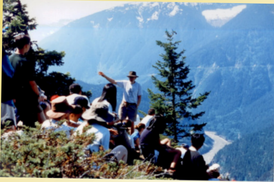
Students learn about the history of British Columbia from a vantage point on the HBC fur brigade trail in the Fraser Canyon.