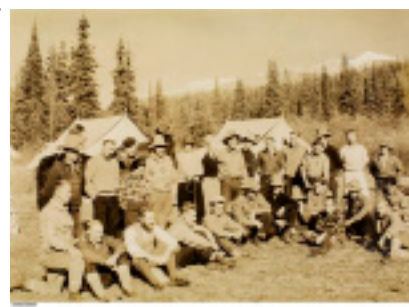
Bedaux expedition members

In this project, 10 Journeys Outreach kits will be developed for long distance travel to support teachers and their students in their projects about Japanese Canadian history through access to information, archives, resources, and research. THEN/HiER funds will be used towards the development of the kits as well as promotion and staff time.