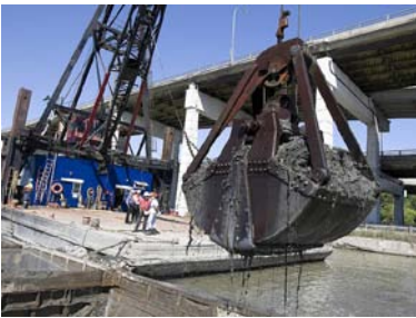
July 2011: Dredging Keating Channel, where the Don enters Lake Ontario.