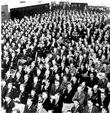
April 1937: UAW Local 222 meeting during Oshawa strike.

At each talk and in TPL blog postings, we highlighted the podcasts on ActiveHistory.ca, and also pointed to the grant received from THEN/HiER.