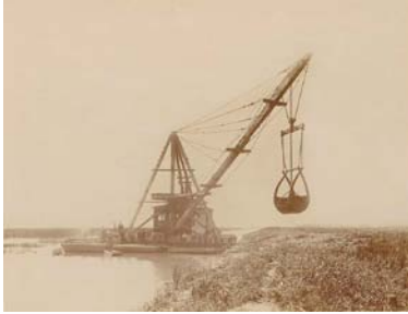
Ashbridge's Marsh looking northeast, circa 1909.